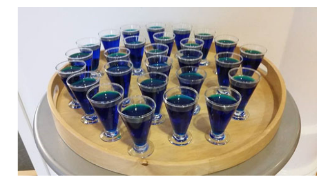
Fig. 1. The blue shot experiment: 'You take the blue pill – the story ends, you wake up in your bed and believe whatever you want to believe. You take the red pill – you stay in Wonderland, and I show you how deep the rabbit hole goes' (Morpheus in The Matrix).

Our approach was to use sensory immersion as a way to create a strong connection between the ocean, global change science and individuals. We combined guided discussions with field trips. Discussions encourage critical thinking, scepticism and allow students to take ownership of ideas and arguments and are also a way to develop a personal connection with a topic (Zeidler, 1997). Field trips promote contact with the ocean and are postulated to have a positive impact on specific aspects of learning (e.g. Ramasundaram et al. , 2005). For example, Stepath (2006) showed that a field trip